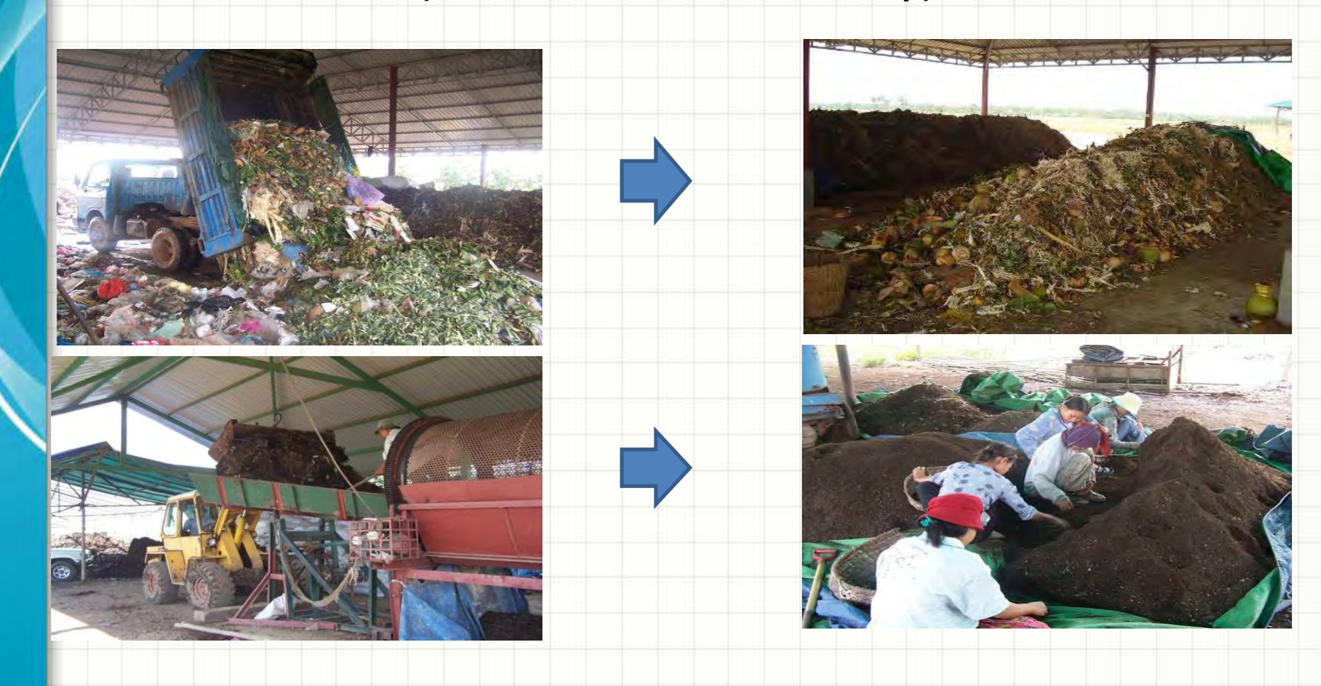
SAB – Social Center Waste Management 8000 m<sup>2</sup> (city land), next to dumpsite, with the current situation able to process organic market only waste 10 t/day (22m<sup>3</sup>/day).